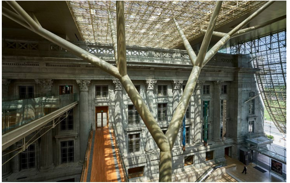
National Gallery of Singapore

A growing regional collector base provides strong artistic patronage and the foundation