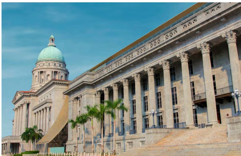
National Gallery of Singapore

A growing regional collector base provides strong artistic