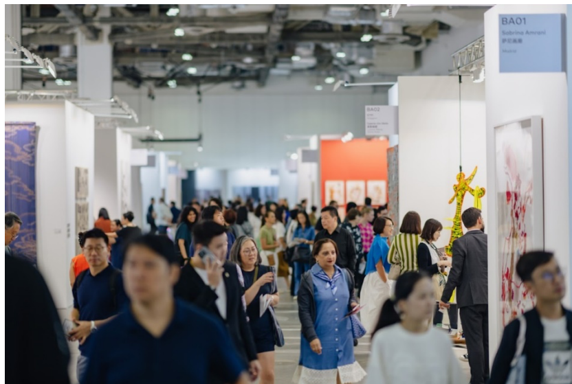
Installation view at ART SG 2025.